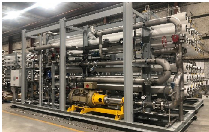
Reverse osmosis water treatment system at PAW improves water recycling capabilities

in conventional and thermal operations since 2016, equivalent to ~11,300 Canadian football fields