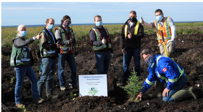
One millionth reclamation tree planted at Albion

"To develop people to work together to create value for the Company's shareholders by doing it right with fun and integrity." To keep up to date with what's happening at Canadian Natural and our involvement in your community, follow us on: