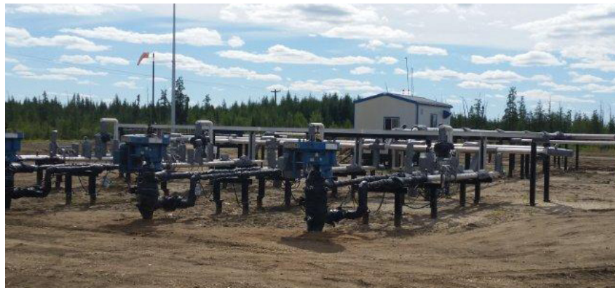
Our Pelican Lake polymer flood operations use an oil recovery process pioneered by Canadian Natural

received in 2020 for 2,065 hectares reclaimed, the most of any operator in Western Canada