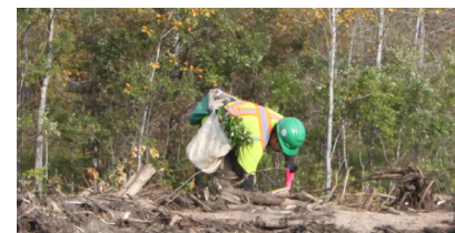
Planting trees in Grande Prairie

to date across all operations – one of the final reclamation steps to support a healthy ecosystem