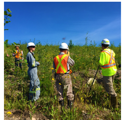
Tree planting at Albian operations

planted at Albian since 2002 and Horizon since 2009